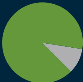
Triumph Business Capital Client Portfolio Mix